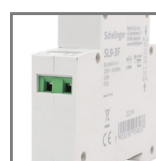
terminal capacity: SL9 max. 2.5mm 2