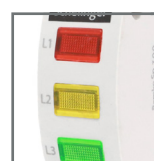
SL9 – different signaling for each phase