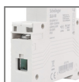
terminal capacity: SL8 max. 25 mm 2