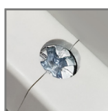
galvanised steel terminals